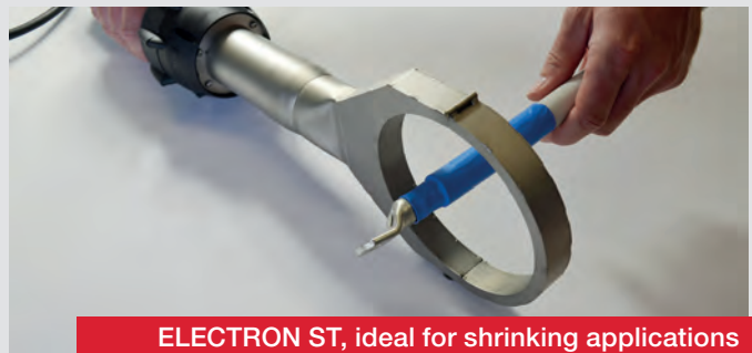
ELECTRON ST, ideal for shrinking applications