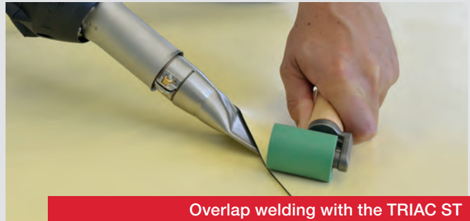
Overlap welding with the TRIAC ST