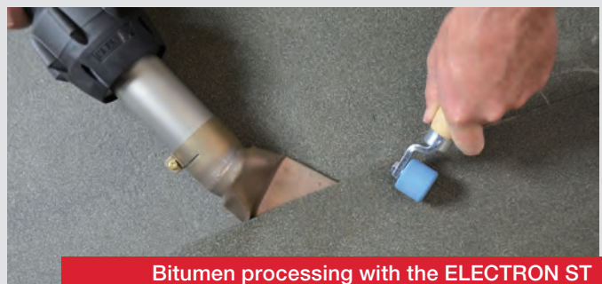
Bitumen processing with the ELECTRON ST