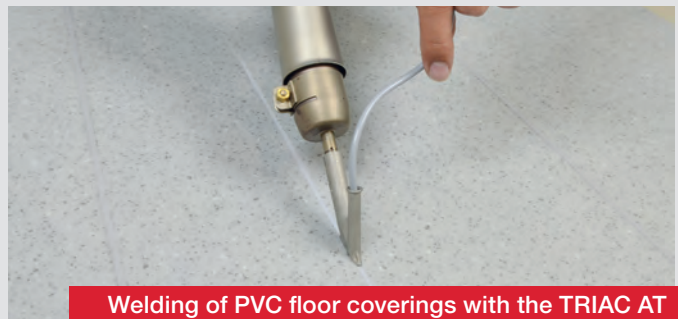
Welding of PVC floor coverings with the TRIAC AT